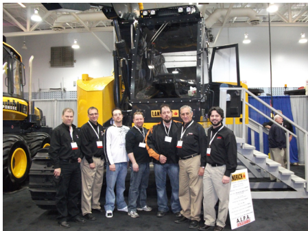
Representatives of ALPA Equipment, A. Landry Fabrication and Litaliens Operations, with the first Landry harvester at the Atlantic Heavy Equipment Show in Moncton, New Brunswick, Canada.

– and tells the machine how to cut. The database prioritizes certain combinations of diameter and length to maximize the value of the wood processed for the machine owner. On a particular Tuesday, for example, the mills may be paying top dollar for eight-foot lengths. On a Thursday, it might be 12-foot lengths. In either case, the harvester cuts the log in the most profitable way and moves onto the next tree.