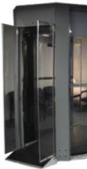
Provision™ Security Portal

“We couldn’t have achieved what we did any other way. Arena enabled us to get a highly complex product into a new market in half the projected time with the flexibility to respond quickly to customer requests and demands in a growing and fairly young industry. It’s a powerful advantage to have a secure tool that can scale this readily and cost-effectively.”