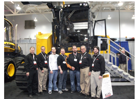
Representatives of ALPA Equipment, A. Landry Fabrication and Litaliens Operations, with the first Landrich harvester at the Atlantic Heavy Equipment Show in Moncton, New Brunswick, Canada.