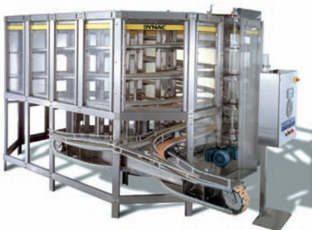
Hartness International's DYNAC conveyor system intelligently regulates the flow of various products during packaging and packing.

To succeed in this business, you must be able to create new machines rapidly and easily. With SolidWorks software, you can reuse previous design work to create multiple variations of a product in a single document.