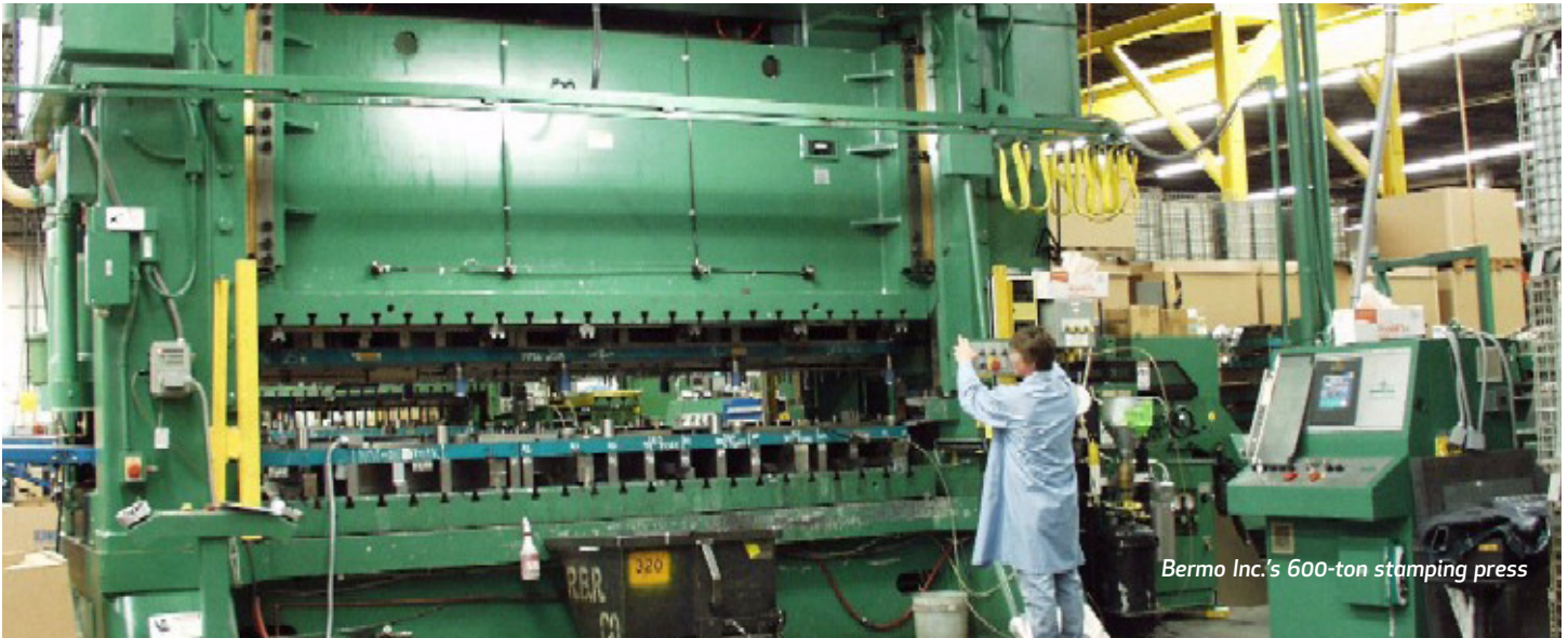
Bermo Inc.'s 600-ton stamping press

Improving die design throughput and accuracy with SolidWorks software and 3D QuickTools