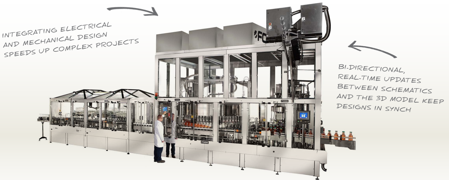
Bottle Filling Machine | Fogg Filler

Real-time integration of 2D and 3D electrical system design